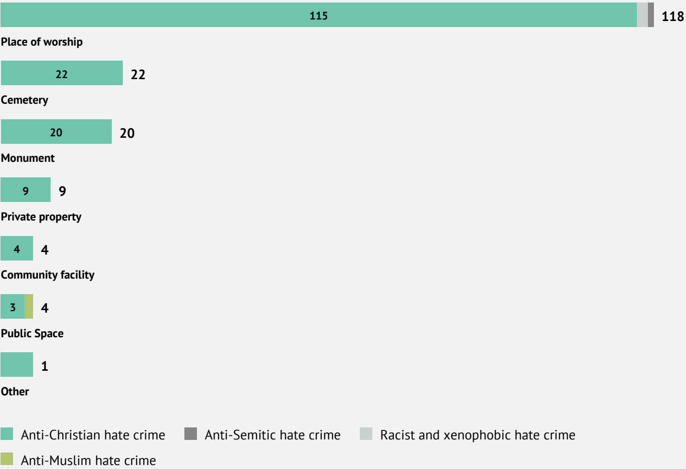
Total 165 incidents targeting properties